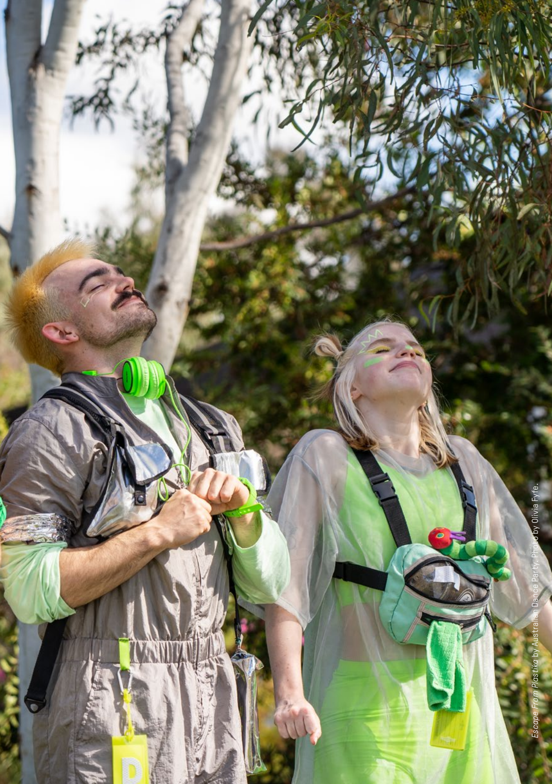
Escape From Plastica by Australian Dance Party.